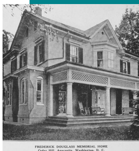
FREDERICK DOUGLASS MEMORIAL HOME Cedar Hill, Anacostia, Washington, D. C.